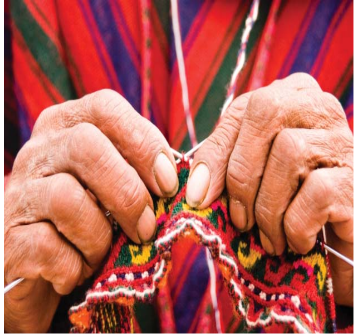
Knitting hands, Quechua man in Pisac, Peru