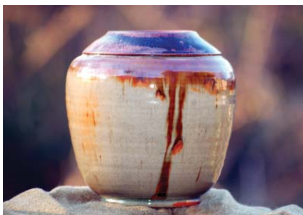
stoneware pottery by Jim Lay